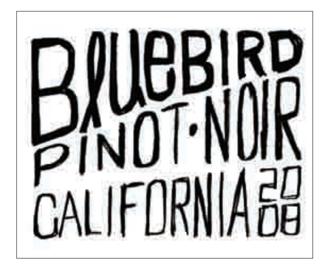
The feel and style of the final type are evident in this sketch. The Bluebird name, though, has less prominence here, and there's less size variation between the three messages.

sunny day after a fresh snowfall. Bluebird's target market—Millennials with active lifestyles—has grown the phrase's meaning to describe any day filled with simple pleasures.